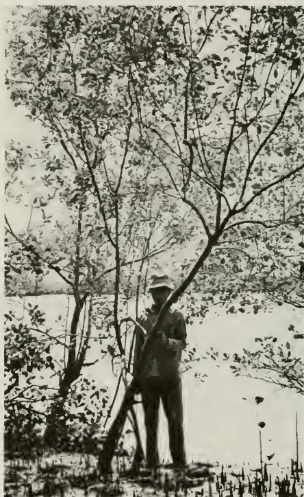
Fig. 4. Avicennia officinalis , showing prop-roots

These same authors describe the pollen grains as being the same